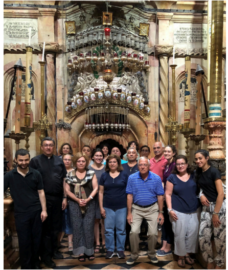
Tomb of Christ July 2019