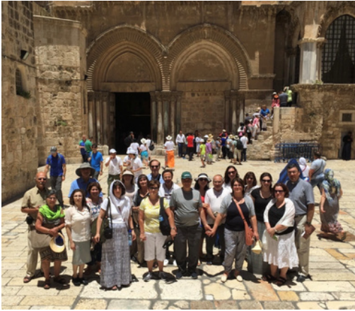
Tomb of Christ July 2015