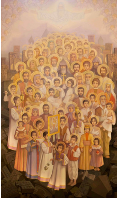
The Icon of Holy Martyrs of the Armenian Genocide