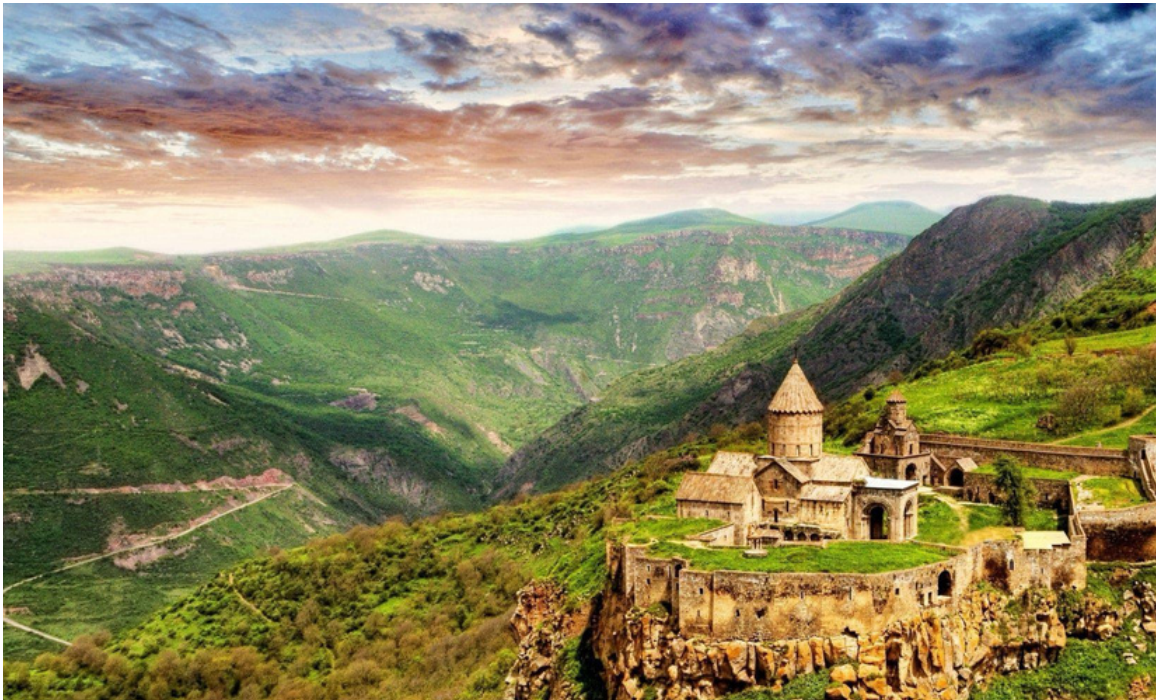
Datev Monastery in Southern Armenia