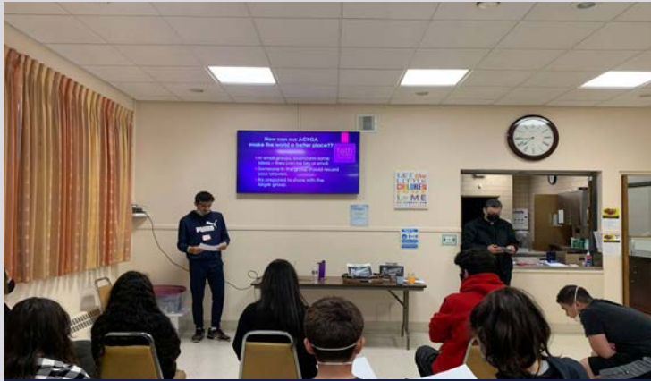
ACYOA Juniors lock-in