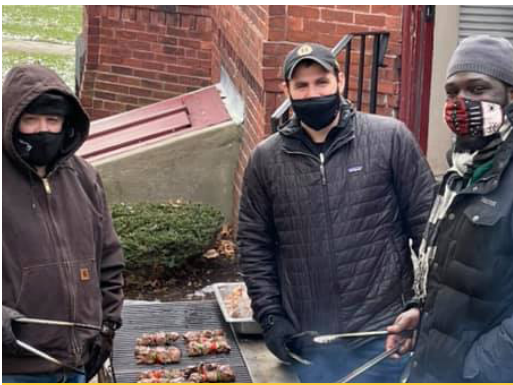
Grilling for the Grab-and-Go Bazaar