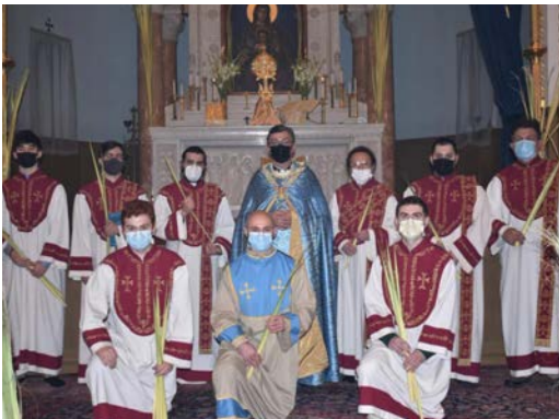
The altar servers on Palm Sunday