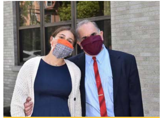
Welcome Back Sunday in September

Holy Trinity's choir sings outside during the Blessing of the Rahan (Holy basil) service