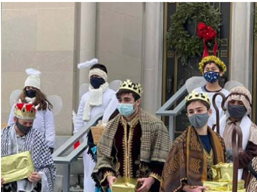
Christmas Pageant, held outside this year