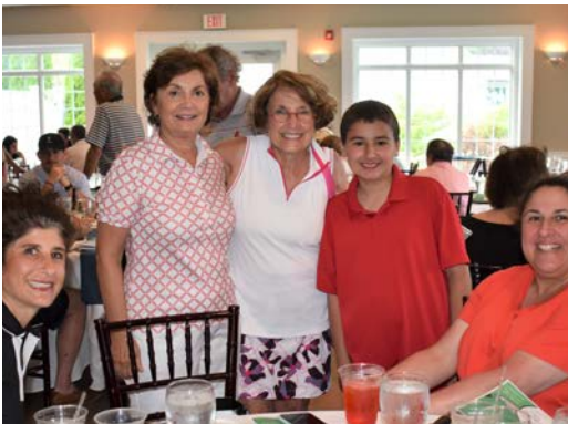
Enjoying the banquet at the golf tournament