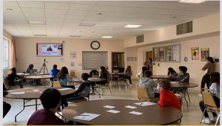
ACYOA Juniors meeting