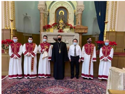
After the Blessing of the Water