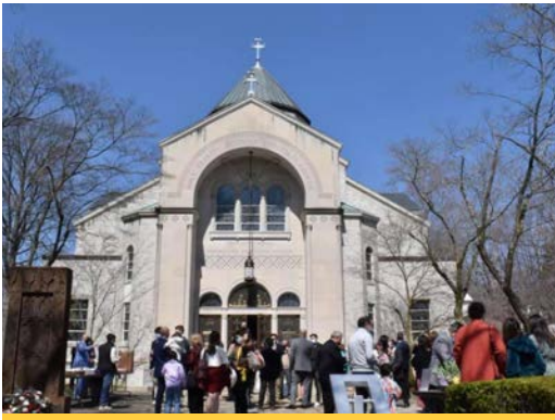
Hollisian Plaza on Easter Sunday