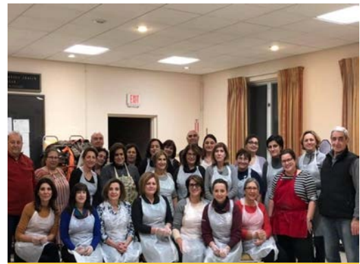
Bazaar baking night volunteers

Holy Trinity thanks all the volunteers who made the Grab-and-Go Bazaar a success! We couldn't have done it without you!