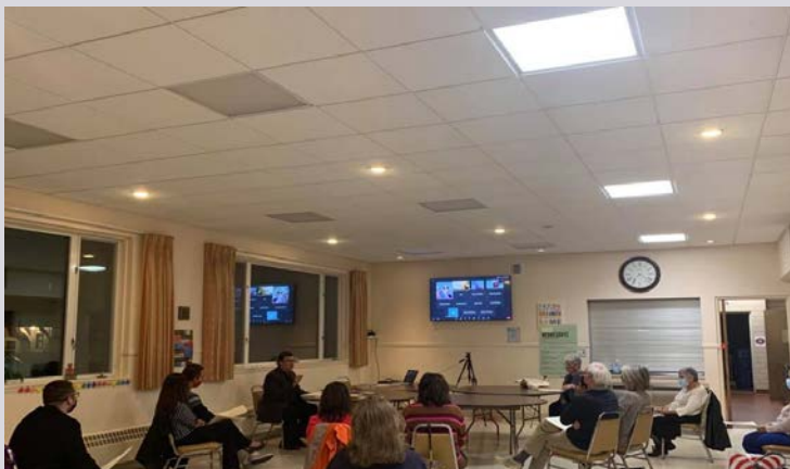
First Wednesdays Zoom and in-person participants