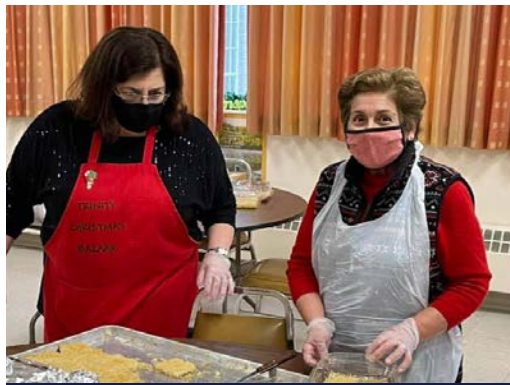
Serving khadayif for bazaar orders