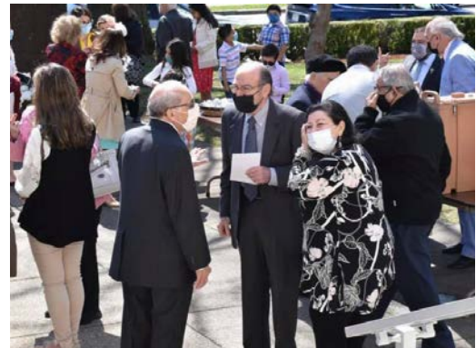
Fellowship after Easter Sunday Badarak