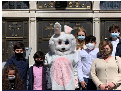
Easter Family Worship Celebration