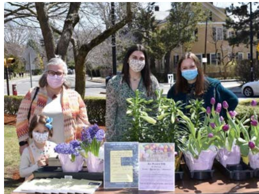
ACYOA's annual Easter plant sale