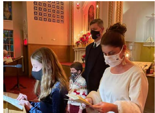
Christmas Eve service