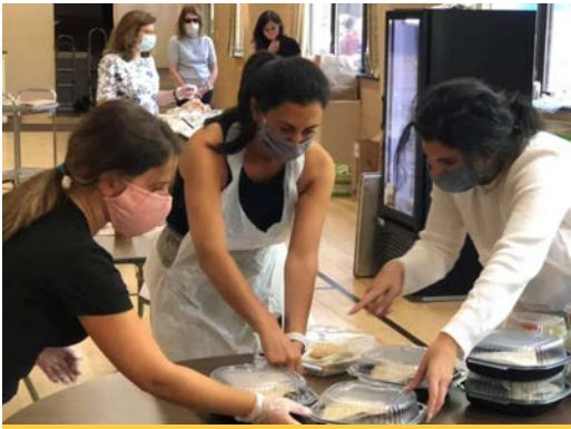
Preparing meals for the fall picnic