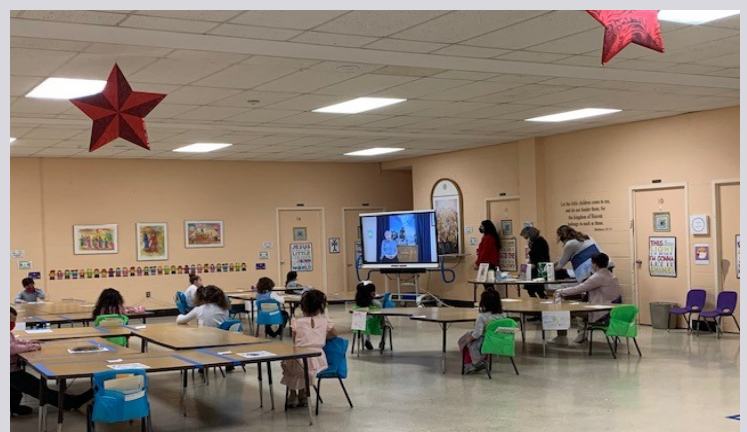
Sunday School watching a recorded message on the SMARTboard