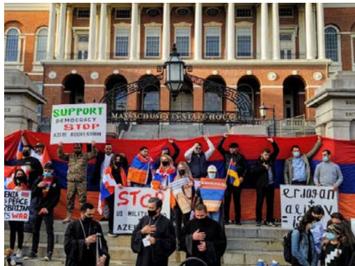
Greater Boston community rally for Artsakh