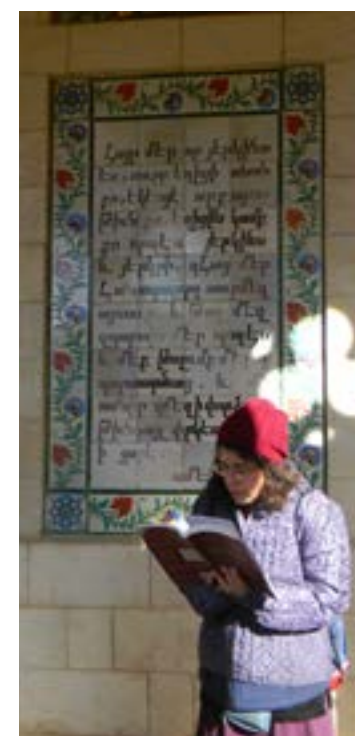
PARISH PILGRIMAGE TO JERUSALEM JANUARY 13-23 2014