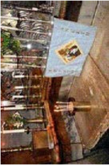
Inside the Tomb of Christ where the Body of Christ was laid. From our Parish Pilgrimage to Jerusalem