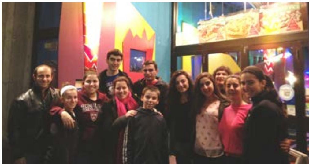
ACYOA Juniors enjoying dinner at Fire + Ice in Harvard Square

http://www.cradlestocrayons.org/boston/donate-goods-items-we-accept .