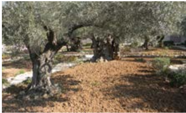
From top, Garden of Gethsemane; entrance to the Tomb of St. Mary; Blessing of Water at Jordan River; and Pilgrims wading in the Dead Sea