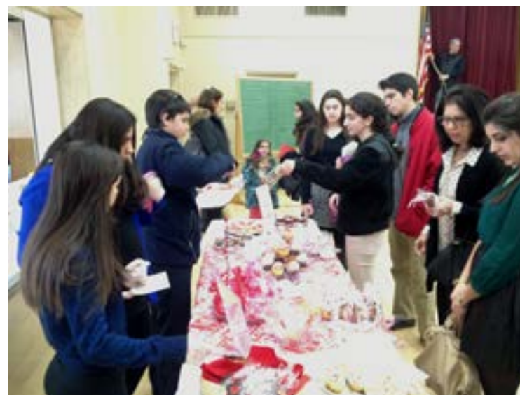
Valentine's Bake Sale held on February 9