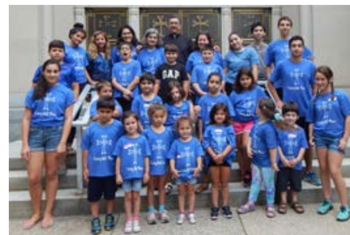
Week 2 Trinity Kids

Please mark your calendars for the 2018 season, August 6-10 and August 13-17. Trinity Kids' Place is open to children ages 3-9 (3 by January 1, 2018). Applications will be available by April 1, 2018. Please contact the Director at youth@htaac.org with any questions.