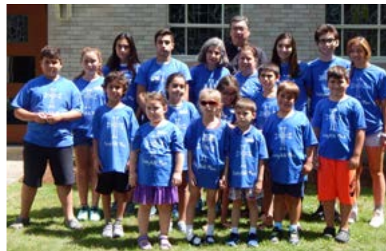
Week 1 Trinity Kids