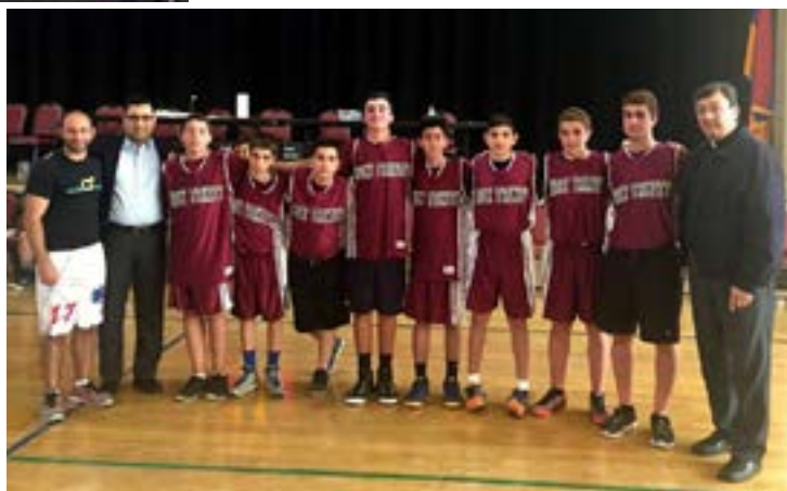
Our Boys' Basketball Team