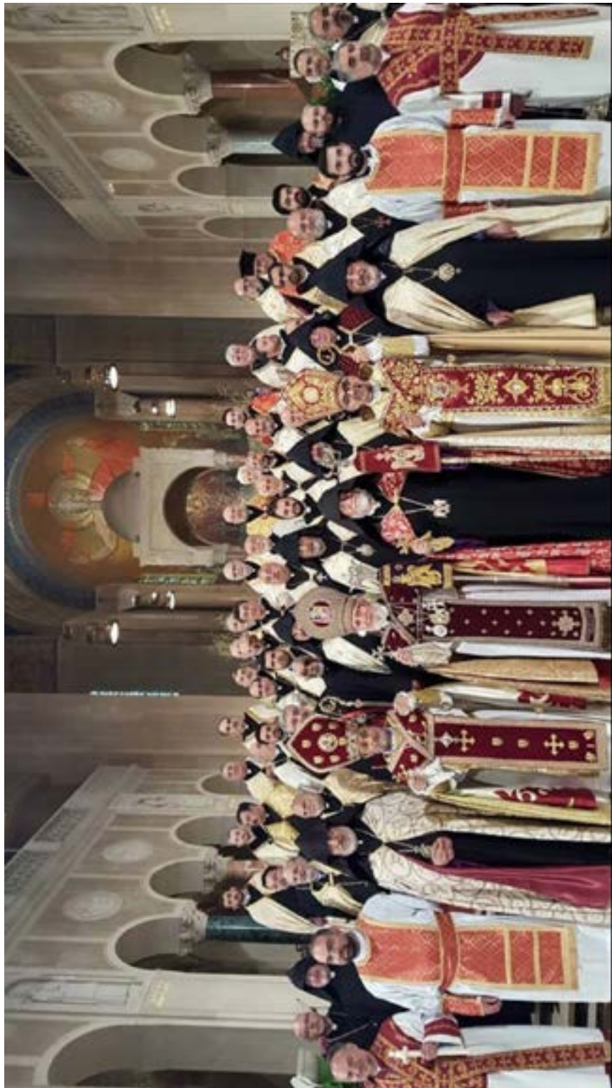
HIS HOLINESS KAREKIN II, SUPREME PATRIARCH AND CATHOLICOS OF ALL ARMENIANS, AND HIS HOLINESS ARAM I, CATHOLICOS OF THE GREAT HOUSE OF CILICIA, WITH CLERGY FROM THE EASTERN AND WESTERN DIOCESES AND THE EASTERN AND WESTERN PRELACIES AT THE BASILICA OF THE NATIONAL SHRINE OF THE IMMACULATE CONCEPTION, WASHINGTON, D.C., ON SATURDAY, MAY 9, 2015, FOLLOWING A PONTIFICAL DIVINE LITURGY.