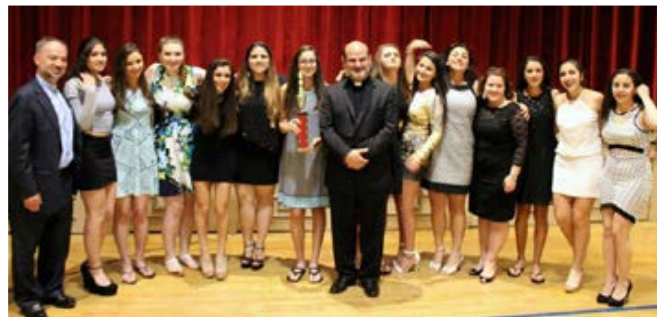
GIRLS' BASKETBALL TEAM WITH TROPHY