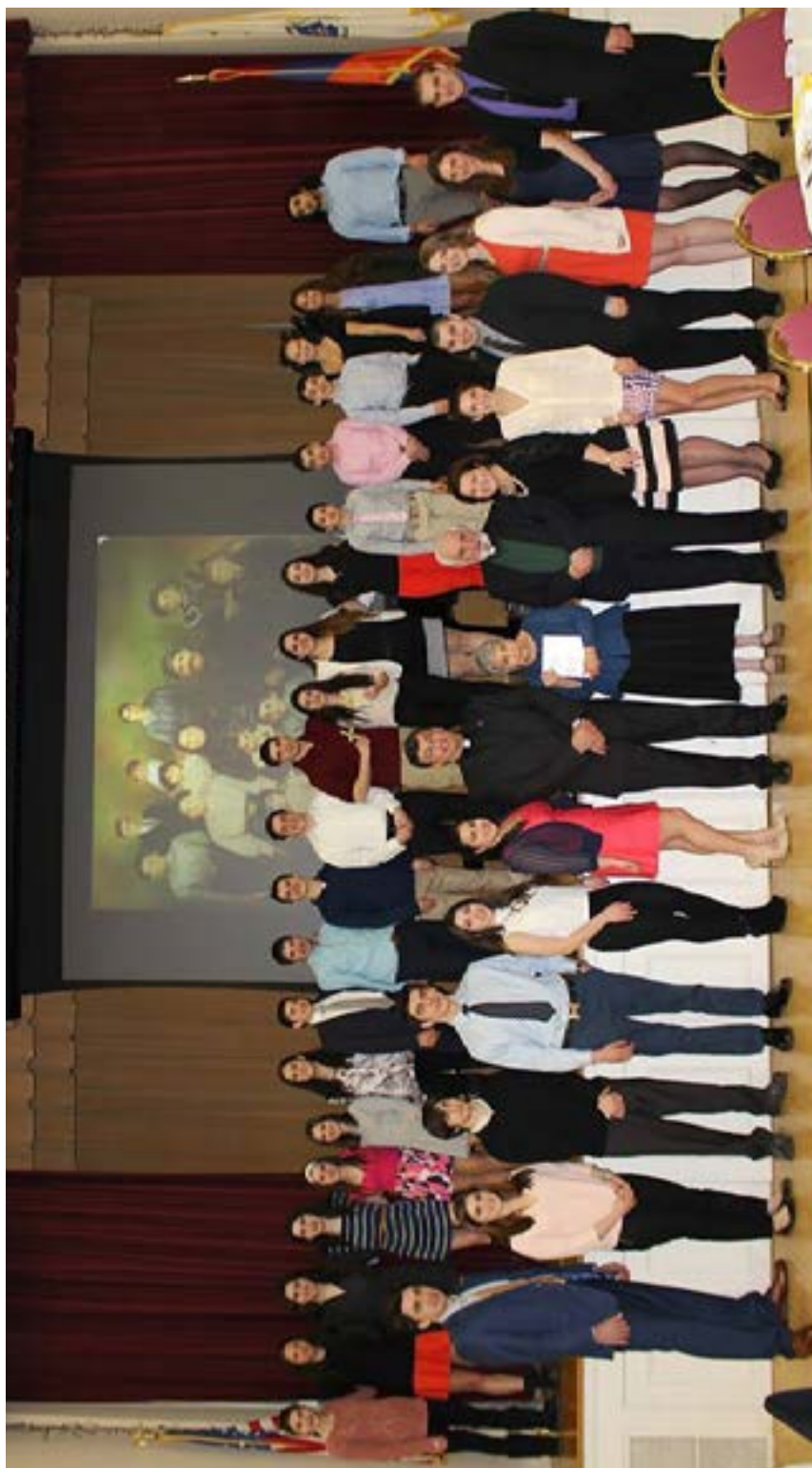
Palm Sunday Banquet, March 29, 2015