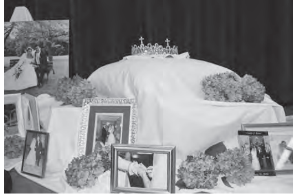
CELEBRATING MARRIAGES October 16, 2011