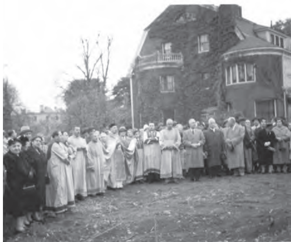
Blessing of church grounds November 1, 1959