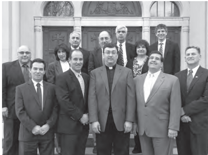
2012 Parish Council