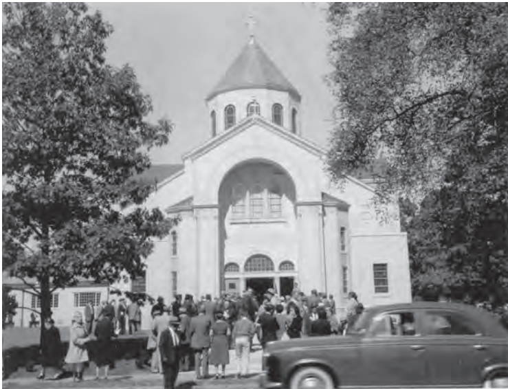
Opening Day September 17, 1961

On September 17, 1961, the day of the Feast of the Exaltation of the Holy Cross, the Church was consecrated in a solemn ceremony and the first Divine Liturgy was celebrated by the Primate at the time, Archbishop Sion Manoogian. The Church overflowed with people who came to worship, to celebrate, and to give thanks.