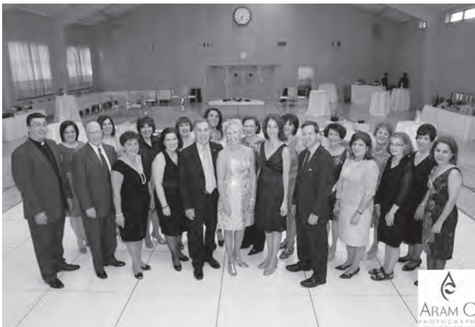
Our Golden Jubilee Gala Committee