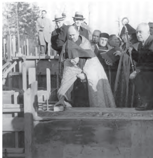
Laying of Cornerstone December 20, 1959