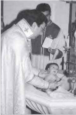
CELEBRATING BAPTISMS September 18, 2011

IT WAS A WONDERFUL YEAR OF CELEBRATIONS EACH UNIQUE EVENT, 50 YEARS IN THE MAKING - IN FAITH, HOPE, AND LOVE.