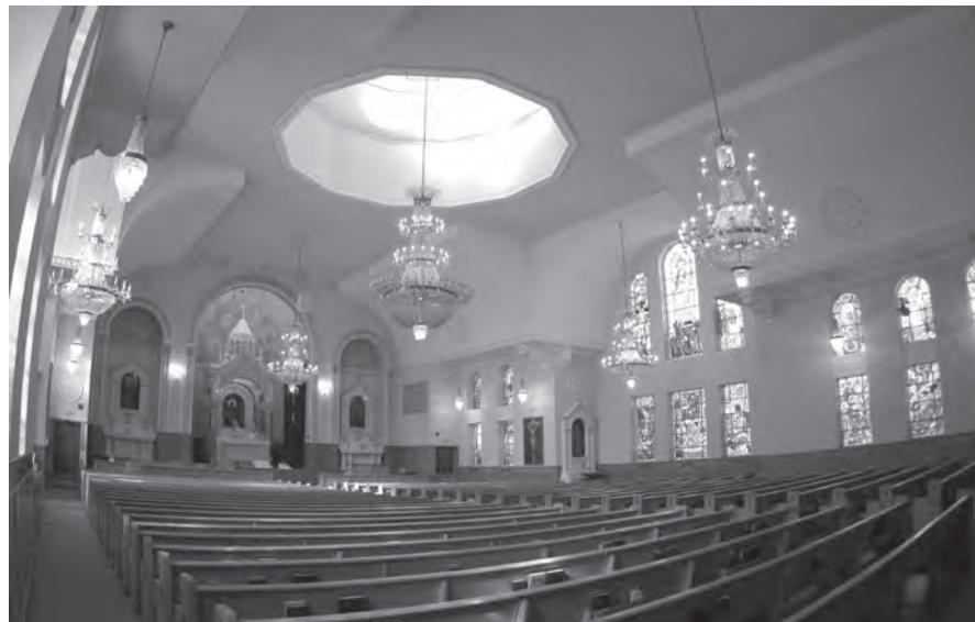
Our beautiful sanctuary