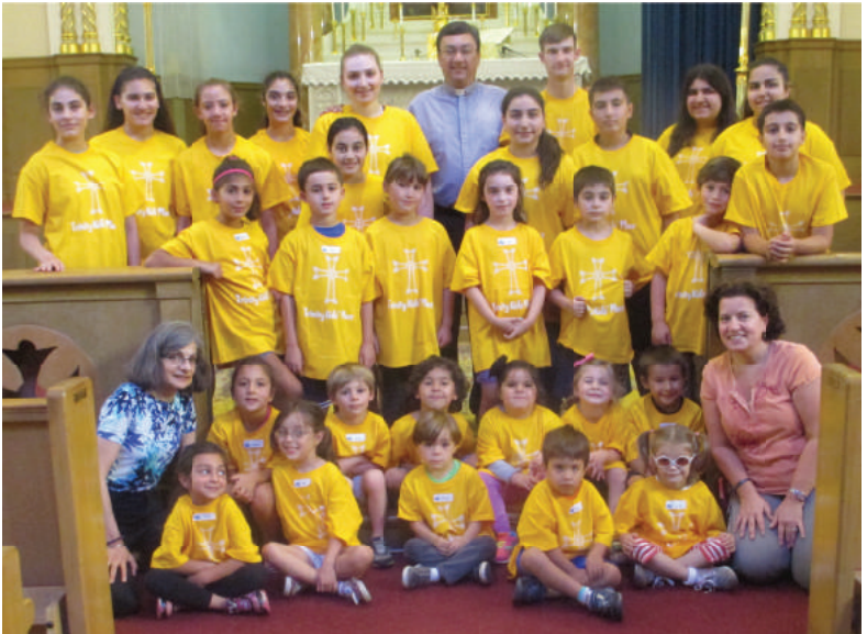
Our Week 2 Trinity Kids' Place Family

Centered on the theme, "Living Out the Ten Commandments," participants learned that God gave us the Ten Commandments to help us understand how we should act towards Him and how we should act towards one another. During the first week, participants