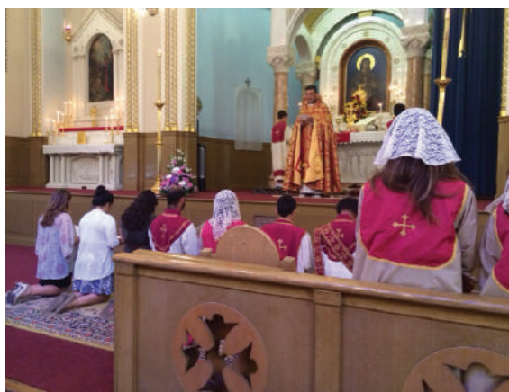
Serving on the Altar and singing in the Choir