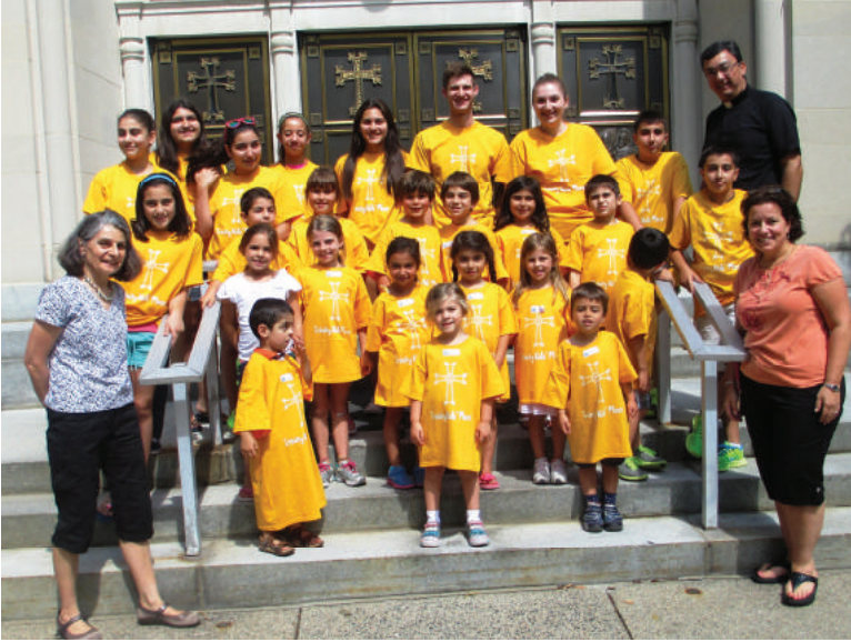
Our Week 1 Trinity Kids' Place Family