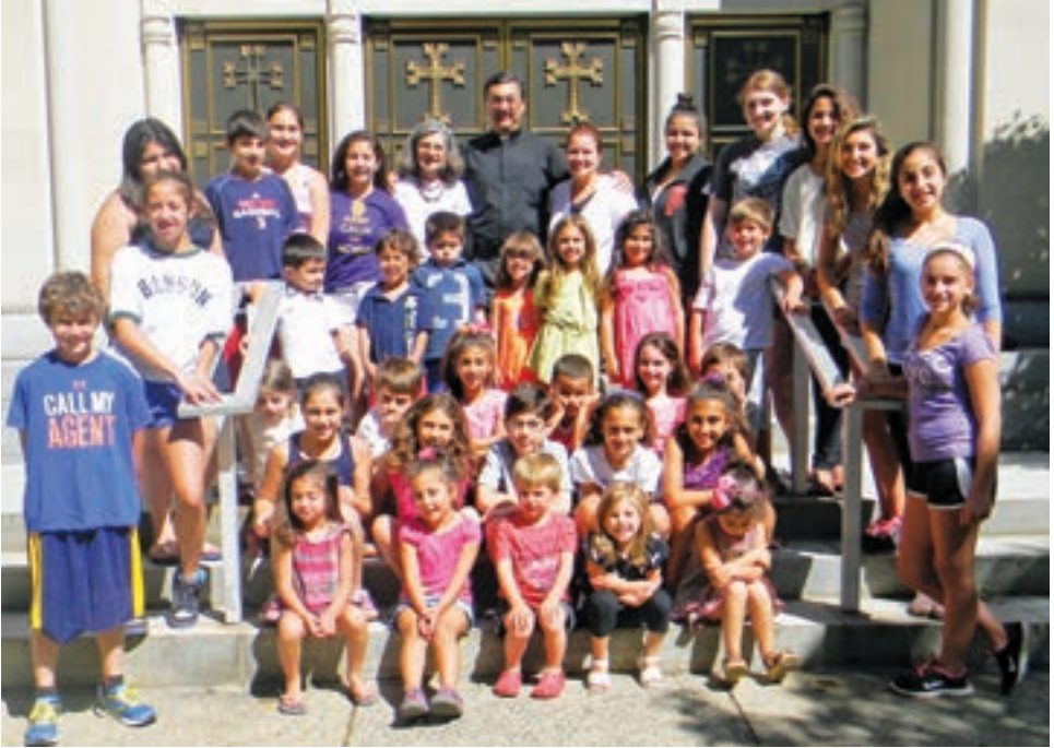
"The 2013 Trinity Kids' Place Family"

"Blessed is the man who will eat at the feast in the kingdom of God." Luke 14:15