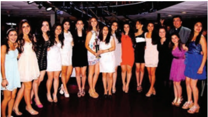
ACYOA Juniors Hye M'rtsoom Girls' Basketball Champions

Congratulations and many thanks to the 24 ACYOA Juniors who participated in the 38th annual Hye M'rtsoom Sports Weekend hosted by St. James Armenian Church in Watertown, MA, from May 24-27.