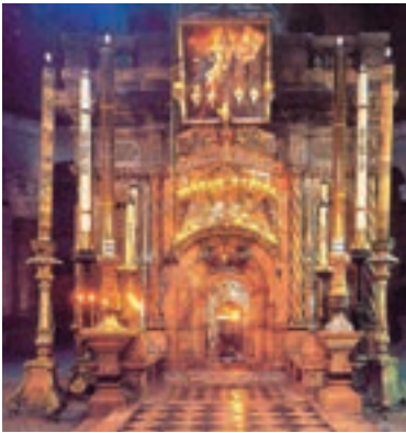
Tomb of Christ

Includes: round-trip airfare from Boston; 9 nights accommodations; two meals daily; luxury bus transportation; entrance fees to all sightseeing destinations; and taxes. English tour guide. Rooms are based on double occupancy.