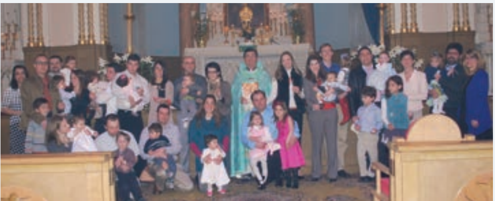
Our joyful annual Blessing of the Babies' Service took place on April 14.