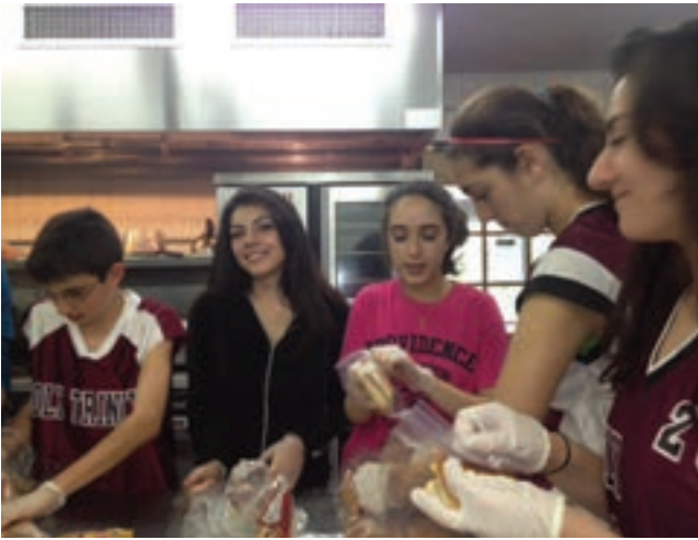
Preparing sandwiches for the shelter