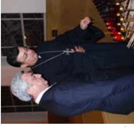
Photo: Armenia's President Sargsyan lighting a candle with our Pastor during his visit to our church, March 28